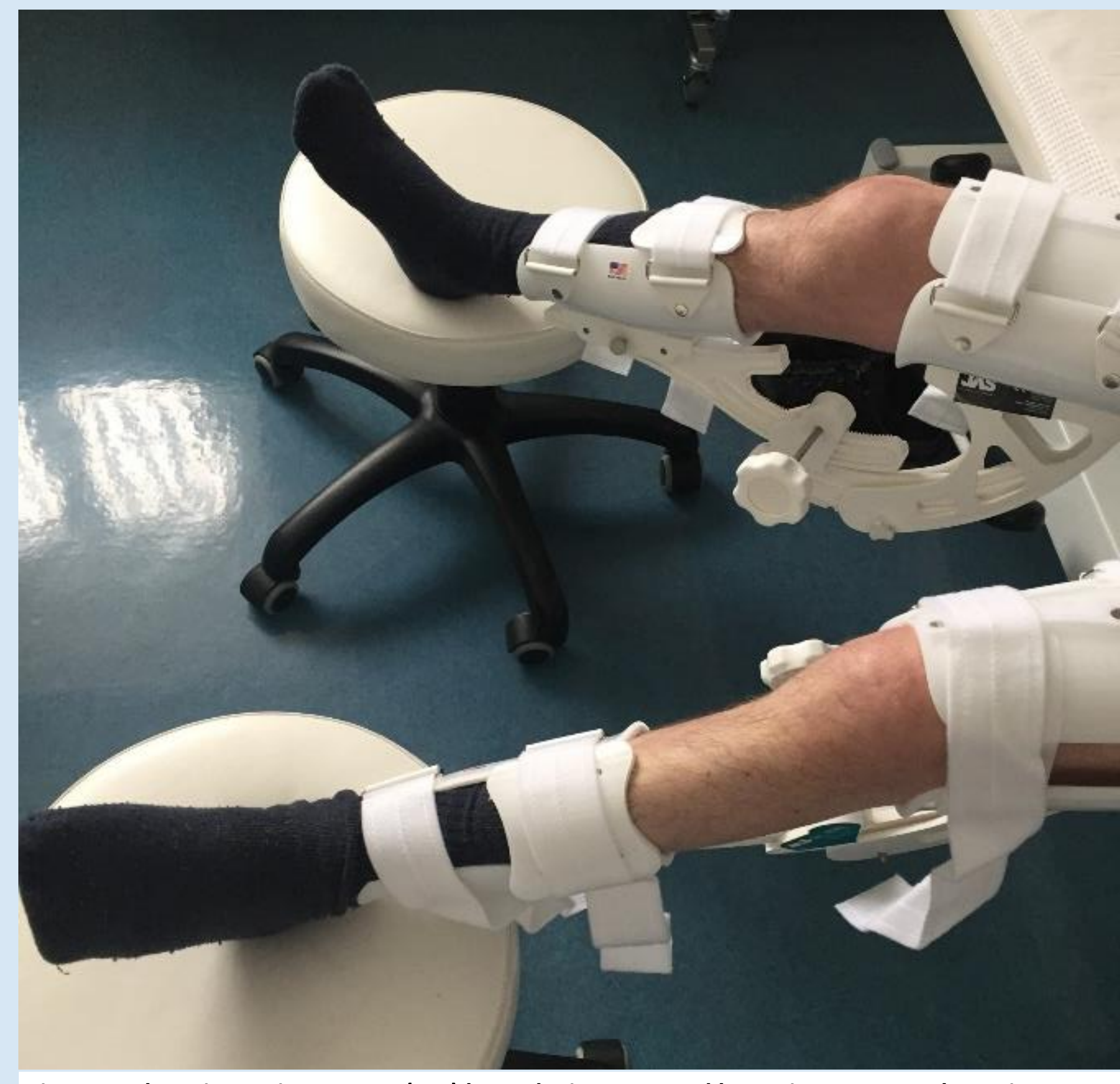
Figure 1: The Joint Active System (JAS) knee device was used by patients two to three times per day in 30-minute treatment sessions

Outcome Score and the Knee Society Score performed before the treatment and after the treatment. Every week the range of motion was measured with a goniometer.